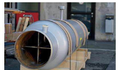
The bellows venting of the interior pressure chamber (thin inside tube) and the outgoing flanged connector outlets at the top for venting the expansion joint are visible.