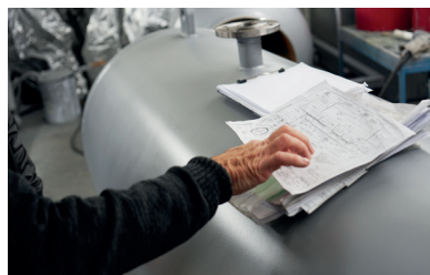
Verification of the technical details and visual quality assurance.