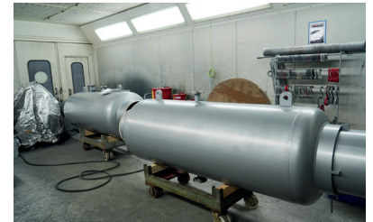
Coating with zinc dust paint in the paint booth.

In the case of an pressure balanced expansion joint, the pressure compensation is achieved by means of a circular pressure chamber using two identical externally pressurized bellows. The flow is redirected.